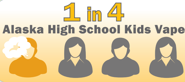
Data Source: Alaska Youth Risk Behavior Survey (YRBS) 2019

The number of Alaska high school students who smoke combustible cigarettes has decreased over time and many lives have been saved, but there is still work to do.